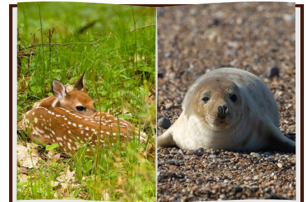
Safe and Waiting for Mom